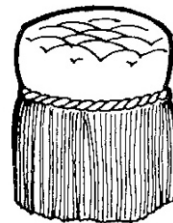
Padding and fringe